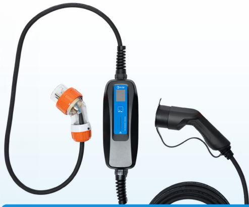
Available in 32 Amp | 3 or 5 pin plug