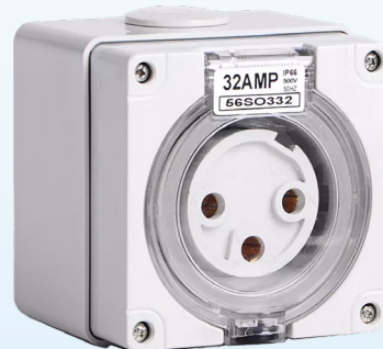
32 Amp - 3 pin plug socket