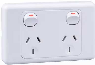
10 Amp plug socket