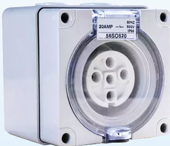
20 Amp - 5 pin plug socket