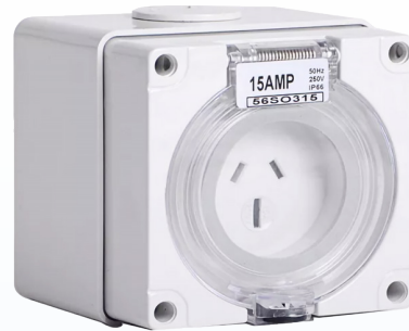
15 Amp plug socket