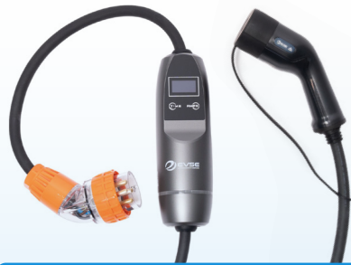
Available in 32 Amp 5 pin plug

Charge your EV from a single phase outlet quickly without waiting all night to charge. This high quality fast portable charger will get you charging faster and driving further.